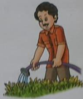
Gardener is watering the plants.