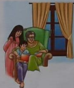
Grandma is telling a story.