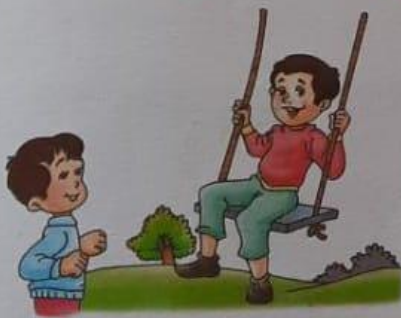
Children are playing.

B Look at the picture and circle the words that show what they are doing.