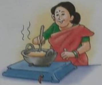
Mother is cooking food.