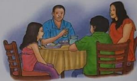
Family is eating dinner.