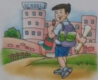
Vicky is going to school.