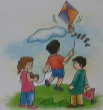
Children are flying a kite.